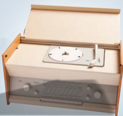
music equipment, 1958