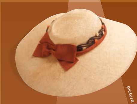
picture hat, 1915

*The reduced price is valid for students, apprentices, volunteers, handicapped, unemployed, and Wiesbaden TouristCard, honorary office card, and kur card holders.