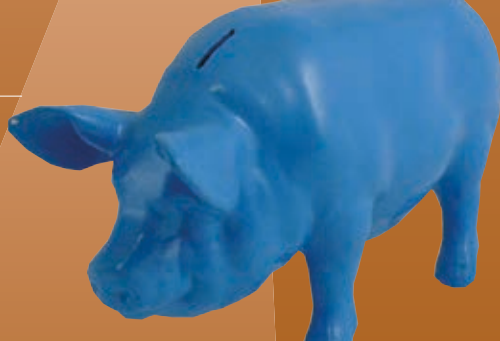
blue piggy bank, 1990