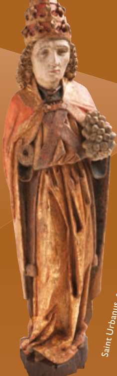
Saint Urbanus, around 1500